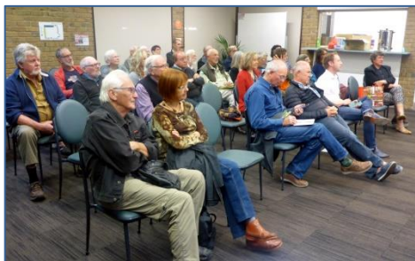
Left – AGM attentive audience