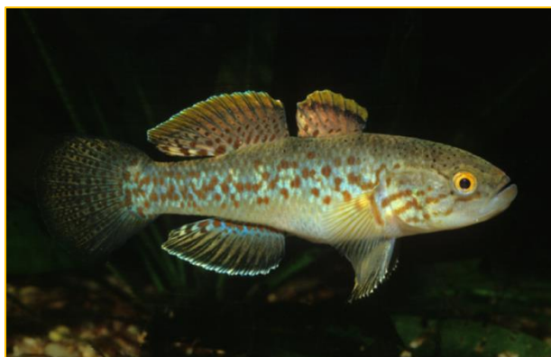
Flinders Ranges Purple –spotted Gudgeon Mogurnda clivicola (Wirti Udla Varri)

They are said to grow to about 14cm in length but the most common size that we see in Weetootla are from 5-8cm. They are mature enough to breed when they are 6-7cm in length. One of the reasons that we measure fish total length (snout to tail tip) is to see if we can discern any age cohorts. That is, a grouping of fish of similar length that we could infer was all born at a similar time and another grouping of larger fish that would signify an earlier hatching. In this way we may be able to infer how fast the fish grow in the wild. By doing this survey for several years we may be able to follow a cohort as it grows, hence we may also be able to ascertain how long they live in their pools. We are also looking for very small fish of length less than 2cm. These would signify a recent hatching and so would be good evidence that the fish are in good enough health to reproduce.