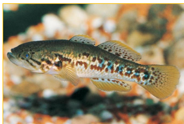
Southern Purple-spotted Gudgeon Mogurnda adspersa (showing 6 purple spots along the distal midline)