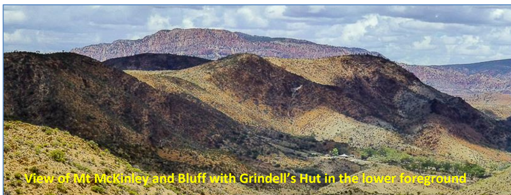
View of Mt McKinley and Bluff with Grindell's Hut in the lower foreground